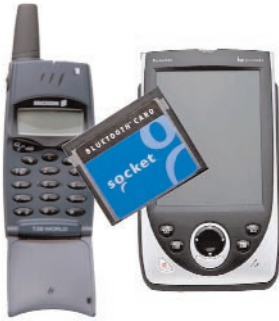
Bluetooth Card, Phone and Pocket PC 2002

CompactFlash Card for Windows Powered Pocket PCs and Handheld PCs