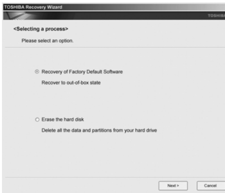
Sample Toshiba Recovery Wizard screen