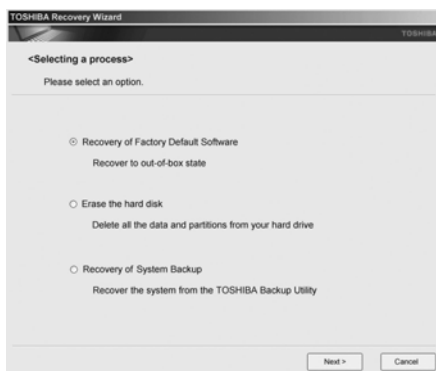
Sample Toshiba HDD Recovery Utility screen