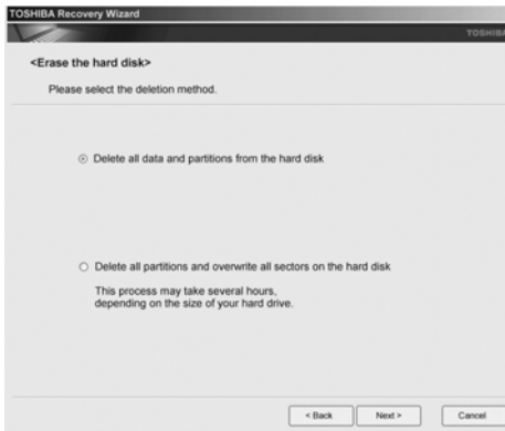
Sample Erase the hard disk screen